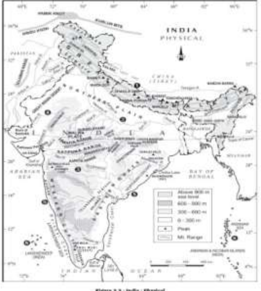
Figure 2.3 : India : Physical

This northward movement of the Indian plate is continuing and it has significant consequences on the physical environment of the Indian subcontinent.